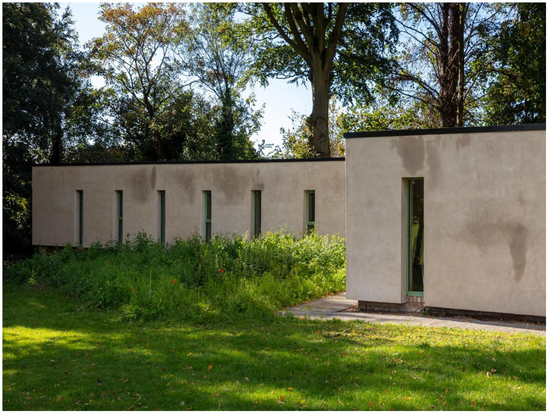
Exterior Lime Render