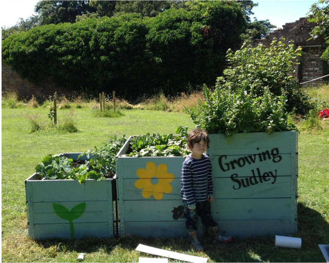
Growing Sudley CIC