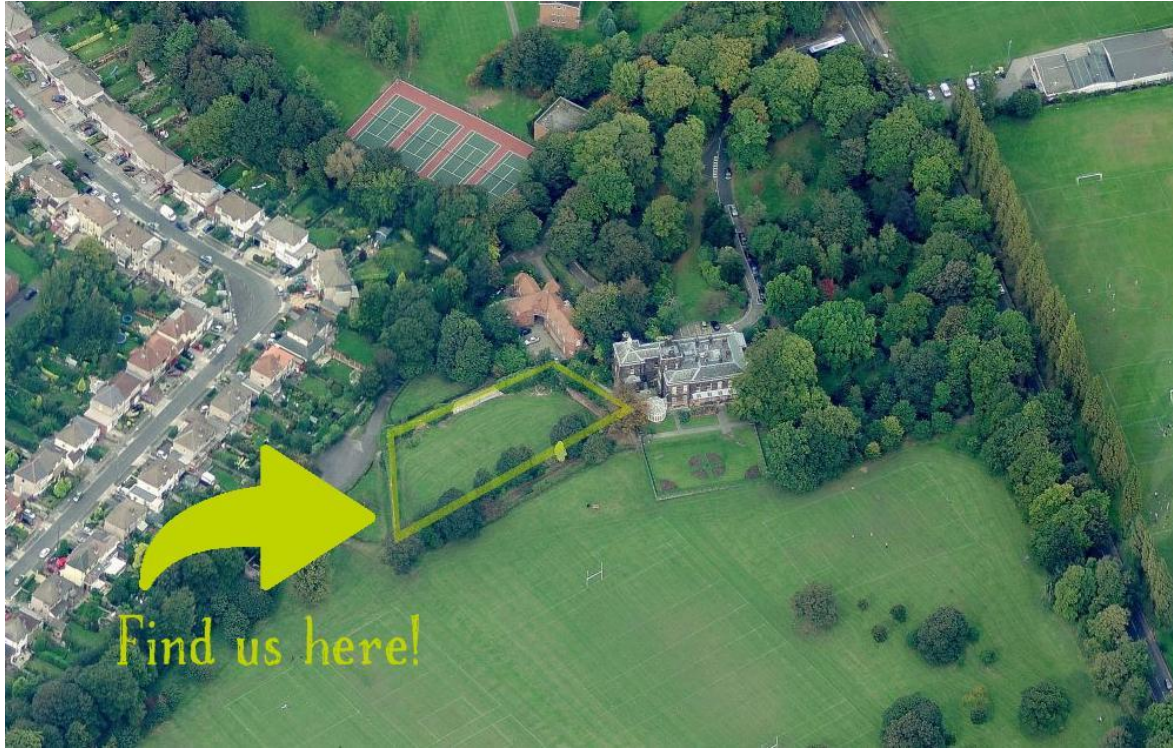
Growing Sudley CIC