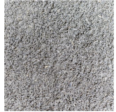
Hempcrete: A Fabric First Approach