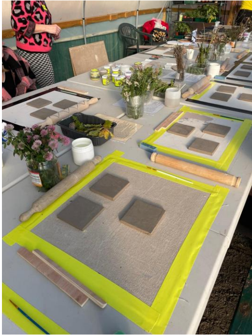
Botanical Tile Workshop