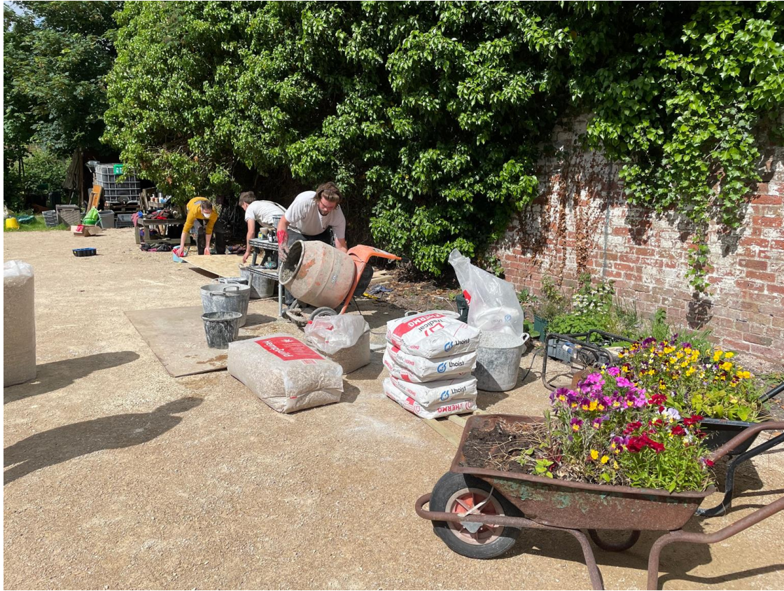
Training and Sample Panels