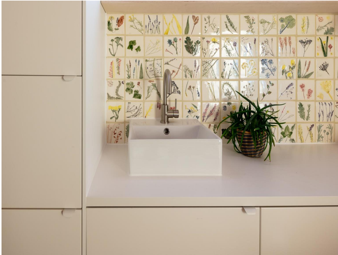
Botanical Tile Installation